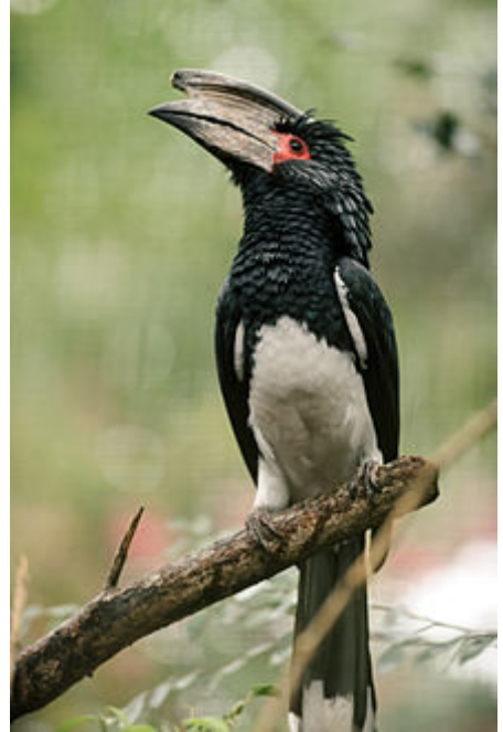
Male at Lowry Park Zoo in Florida, USA