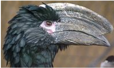
Male head in profile