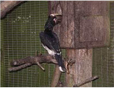
Male feeding female at artificial nest