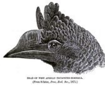
Female head in profile