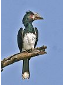
Female in southern Zambia